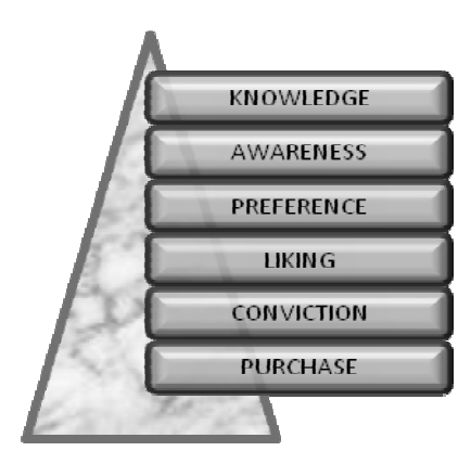
Figure 6: Do-Feel-Think model