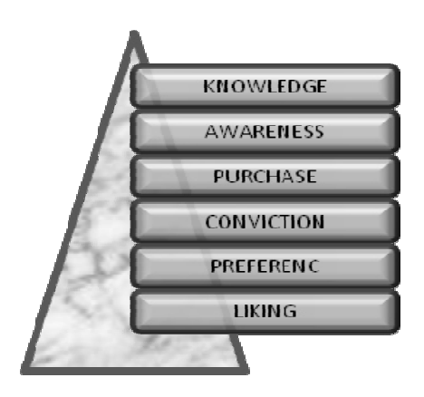
Figure 5: Feel-Do-Think model