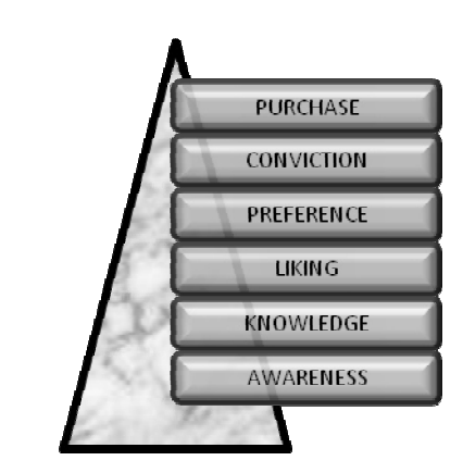
Figure 2. Think-Feel-Do model

Like many other hierarchical models that preceded the THINK-FEEL-DO model, such as the A-I-D-A (Attention, Interest, Desire, Action) and their variations in A-I-D-C-A (Attention, Interest, Desire, Conviction, Action) and P-A-P-A (Promise, Amplification, Proof, and Action), the THINK-FEEL-DO can barely resist the dynamics of change ,or at least, modifications. Wells and Moriaty (2006) noted that sometimes one might just not buy something because one is hungry, or that the product catches one's eyes at the checkout counter. This, in a way demonstrates that, for some known reasons, alternative models or pattern exist to explain consumers purchase decisions other than the Think-Feel- Do model. The suggested and logical paths to explaining such modified patterns of advertising functional processes are illustrated below.