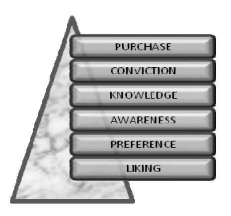
Figure 4: Feel-Think-Do model